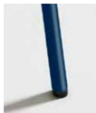
AZUL / RAL 5010 Blue Bleu