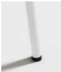
BLANCO / RAL 9003 White Blanc

(color texturado / textured color / couleur texturée)