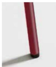
BURDEOS / RAL 3005 Bordeaux Bordeaux