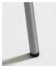
ALUMINIO / RAL 7045 Aluminium Aluminium