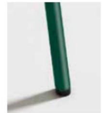
VERDE / RAL 6028 Green Vert