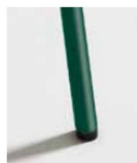
VERDE / RAL 6028 Green Vert