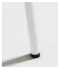
BLANCO / RAL 9003 White Blanc

(color texturado / textured color / couleur texturée)