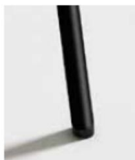
NEGRO / RAL 9005 Black Noir