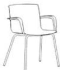
MANILA BASE METALICA