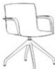
MANILA BASE PIRAMIDAL