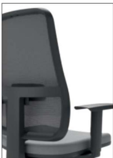
Respaldo en malla