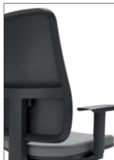
Respaldo tapizado delante