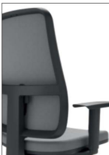
Respaldo tapizado delante y detras